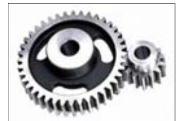
Figure 8-1: Spur gears have straight teeth and are parallel to the shaft axis

Spur gears, or straight-cut gears, are the simplest type of gear. They consist of a cylinder or disk with the teeth projecting radially, and although they are not straight-sided in form, the edge of each tooth is straight and aligned parallel to the axis of rotation. These gears can be meshed together correctly only if they are fitted to parallel shafts. Figure 8-1 shows a typical spur gear. When a pair of gears rotate, the teeth mesh with a combined sliding and rolling motion. To avoid excessive wear of the sliding motion and forces, proper lubrication is important.