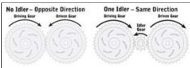
Figure 8-2: Using Idler Gear to Change Gear Rotation

If an idler or an intermediate gear is inserted between the driving pinion and driven gears (see Fig. 8-2), the pinion and gear rotate in the same direction. This configuration does not affect the speed ratio, which is still equal to the number of teeth in the driven gear divided by the number of teeth in the pinion.